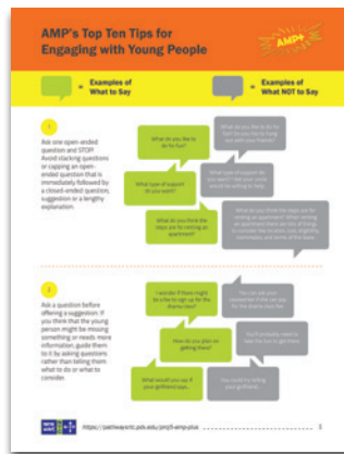
AMP's Top Ten Tips for Engaging with Young People (09/2016)