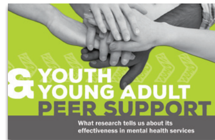
Youth & Young Adult Peer Support: What Research Tells Us About its Effectiveness in Mental Health Services (10/2015)