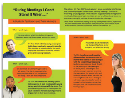
"During Meetings I Can't Stand it When..." A Guide for Facilitators and Team Members (11/2013)